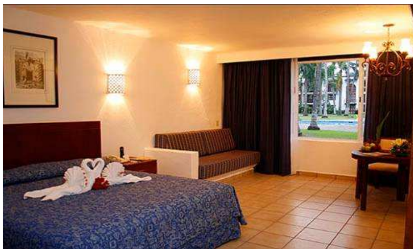
Example of a newly refurbished Aqueduct Section room

Aqueduct Rooms – 483 sq. feet featuring a king size bed or two double beds. Recently renovated, these peaceful and spacious rooms offer authentic Mexican flavor. Surrounded by the lush gardens of the Aqueduct Section, guests enjoy the tranquility with a real aqueduct fountain flowing into the area’s pool. All rooms include mini bar, iron and ironing board, safe deposit box, on command television, alarm clock, hair dryer, vanity mirror, direct dial phone, and air conditioning. Most garden level rooms have an open patio with chairs. Most upper level rooms have a balcony with chairs. (Note: Aqueduct section rooms are past Convo favorites, because they look out on a beautiful courtyard and the resort guests. Picture palm leaves blowing in the wind, a view you will enjoy from either your garden or upper-level aqueduct section room!)