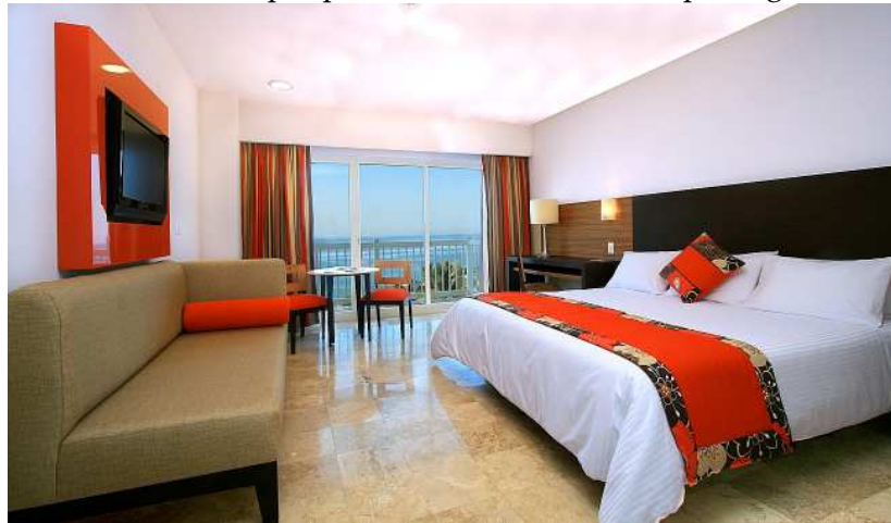
Example of a Grand Tower Oceanview Room

* for 5-nights (April 4-9, 2011) Aqueduct Section room, all meals, drinks, and taxes. Special conference pricing for an additional three nights before and after, "all-inclusive," depending on availability and contract dates: $85 per person, based on double, per night; $139 single, per night.